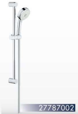
NEW TEMPESTA COSMOPOLITAN 100 SHOWER RAIL SET 4 SPRAYS