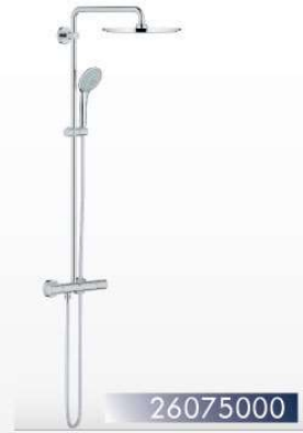
SHOWER SYSTEM WITH THERMOSTATIC MIXER FOR WALL MOUNTING