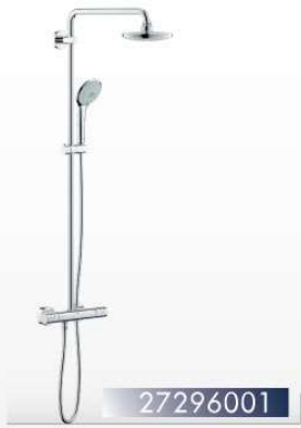
SHOWER SYSTEM WITH THERMOSTAT FOR WALL MOUNTING