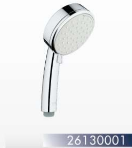
NEW TEMPESTA COSMOPOLITAN 100 HAND SHOWER 2 SPRAYS