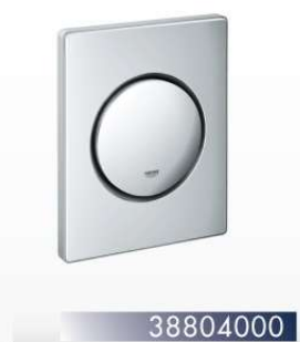
NOVA COSMOPOLITAN WALL PLATE MANUAL ACTIVATION FOR URINAL SET FOR FINAL INSTALLATION FOR 38 787 000 RAPIDO U