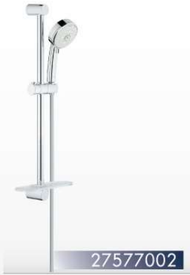
NEW TEMPESTA COSMOPOLITAN 100 SHOWER RAIL SET 4 SPRAYS