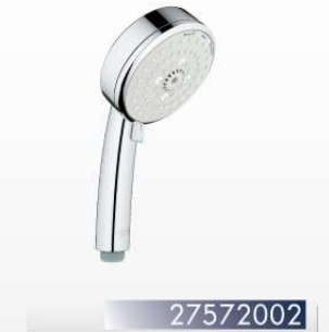
NEW TEMPESTA COSMOPOLITAN 100 HAND SHOWER 3 SPRAYS