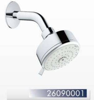
NEW TEMPESTA COSMOPOLITAN 100 HEAD SHOWER SET 3 SPRAYS GROHE RAIN O 2 , RAIN, MASSAGE