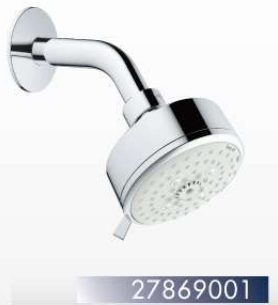
NEW TEMPESTA COSMOPOLITAN 100 HEAD SHOWER 4 SPRAYS