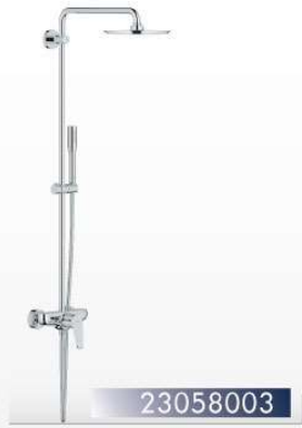
SHOWER SYSTEM WITH SINGLE LEVER MIXER FOR WALL MOUNTING