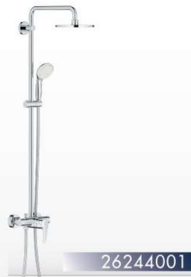
NEW TEMPESTA COSMOPOLITAN 200 SHOWER SYSTEM WITH SINGLE LEVER MIXER FOR WALL MOUNTING