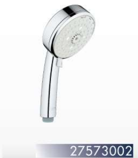
NEW TEMPESTA COSMOPOLITAN 100 HAND SHOWER 4 SPRAYS