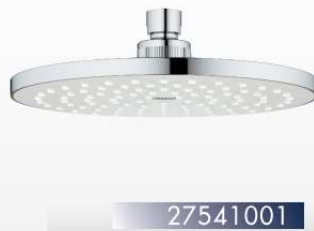
NEW TEMPESTA COSMOPOLITAN 200 HEAD SHOWER 1 SPRAY