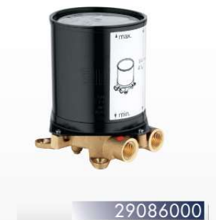
ROUGH-IN SET 1/2" FOR FLOOR-MOUNTED TUB SPOUTS AND MIXERS WITHOUT FINISHING TRIM SET