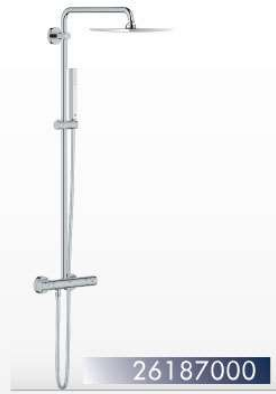
SHOWER SYSTEM WITH THERMOSTAT FOR WALL MOUNTING