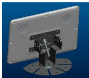
Suitable for curved console