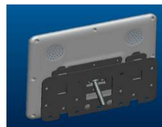
Suitable for hanging