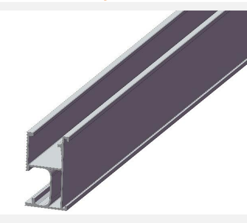
B50 Rail Part No.: ER-R-B50