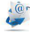
Mobile Alert Email