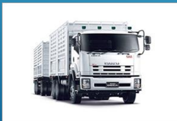
Truck with rear axle