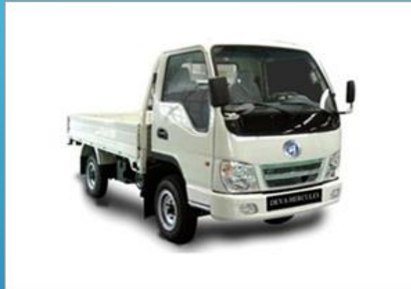
Big 4 wheel truck