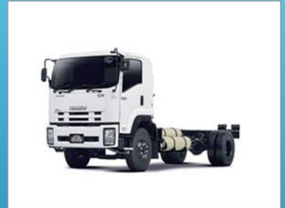
6 wheel truck