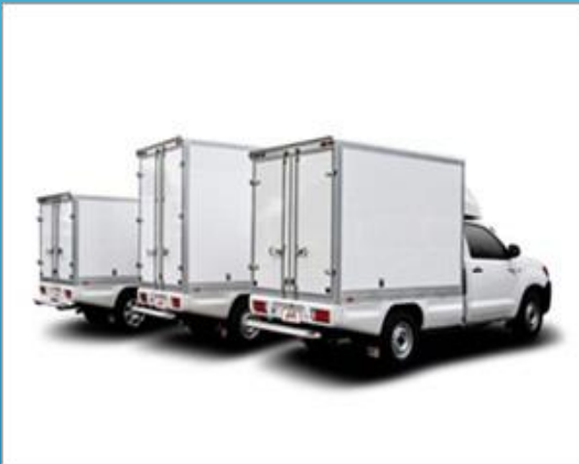
Four wheel drive