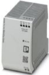
Primary-switched UNO POWER power supply for DIN rail mounting, input: 1-phase, output: 24 V DC/100 W

Please be informed that the data shown in this PDF Document is generated from our Online Catalog. Please find the complete data in the user's documentation. Our General Terms of Use for Downloads are valid ( http://phoenixcontact.com/download )