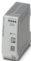
Primary-switched UNO POWER power supply for DIN rail mounting, input: 1-phase, output: 24 V DC/60 W

Please be informed that the data shown in this PDF Document is generated from our Online Catalog. Please find the complete data in the user's documentation. Our General Terms of Use for Downloads are valid ( http://phoenixcontact.com/download )