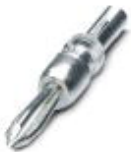
Test plugs, with solder connection up to 1 mm 2 conductor cross section, color: gray