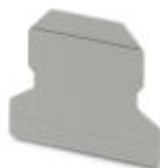
Partition plate, length: 56 mm, width: 1.5 mm, height: 45.7 mm, color: gray