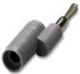
Reducing plug, color: gray