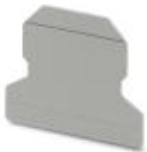
Partition plate, length: 56 mm, width: 1.5 mm, height: 45.7 mm, color: gray