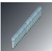
Fixed bridge, pitch: 5 mm, number of positions: 20, color: silver