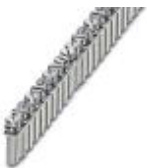
Fixed bridge, pitch: 5 mm, number of positions: 80, color: silver