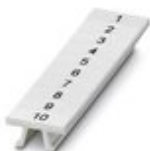
Zack marker strip, Strip, white, labeled, Printed vertically: consecutive numbers 1 ... 10, 11 ... 20, etc. up to 91 ... 100, mounting type: snap into tall marker groove, for terminal block width: 4.2 mm, lettering field size: 4.2 x 10.5 mm, Number of individual labels: 10

Zack marker strip - ZB 4,QR:FORTL.ZAHLEN - 0805807