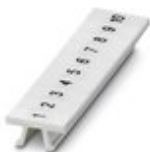
Zack marker strip, Strip, white, labeled, printed horizontally: consecutive numbers 1 ... 10, 11 ... 20, etc. up to 91 ... 100, for terminal block width: 4.2 mm, lettering field size: 4.2 x 10.5 mm, Number of individual labels: 10

Zack marker strip - ZB 4,LGS:FORTL.ZAHLEN - 0805739