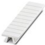
Zack marker strip, can be ordered: Strip, white, labeled according to customer specifications, mounting type: snap into tall marker groove, for terminal block width: 4.2 mm, lettering field size: 4.2 x 10.5 mm, Number of individual labels: 10

Zack marker strip - ZB 4,LGS:FORTL.ZAHLEN - 0805739