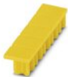
Cover for actuation shaft, 5-pos., for spring-cage terminal blocks with width of 5.2 mm