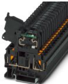
Lever-type fuse terminal block, black, for 5 x 20 mm G fuse inserts, with LED for 24 V AC/DC

Please be informed that the data shown in this PDF Document is generated from our Online Catalog. Please find the complete data in the user's documentation. Our General Terms of Use for Downloads are valid ( http://phoenixcontact.com/download )