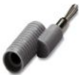
Reducing plug, color: gray