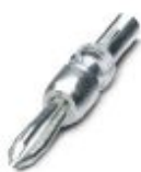
Test plugs, with solder connection up to 1 mm 2 conductor cross section, color: gray