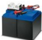
Energy storage device, LI-ION technology, 24 V DC, 924 Wh, for ambient temperatures of -25 °C ... 60 °C, automatic detection and communication with QUINT UPS-IQ

Energy storage - UPS-BAT/LI-ION/24DC/924WH - 2908232