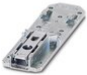
Universal DIN rail adapter

Assembly adapters - UTA 107/30 - 2320089