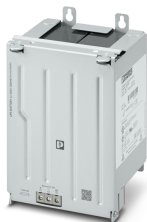
Energy storage device, LI-ION technology, 24 V DC, 120 Wh, for ambient temperatures of -20°C ... 60°C, automatic detection and communication with QUINT UPS-IQ

Please be informed that the data shown in this PDF Document is generated from our Online Catalog. Please find the complete data in the user's documentation. Our General Terms of Use for Downloads are valid ( http://phoenixcontact.com/download )