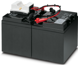
Energy storage device, lead AGM, VRLA technology, 24 V DC, 38 Ah, automatic detection, and communication with QUINT UPS-IQ

Please be informed that the data shown in this PDF Document is generated from our Online Catalog. Please find the complete data in the user's documentation. Our General Terms of Use for Downloads are valid ( http://phoenixcontact.com/download )