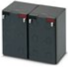
Replacement battery for UPS-BAT/VRLA... energy storage

Uninterruptible power supply replacement battery - UPS-BAT-KIT-VRLA 2X12V/12AH - 2908235