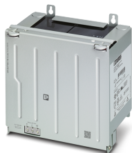
Energy storage device, lead AGM, VRLA technology, 24 V DC, 12 Ah, tool-free battery replacement, automatic detection, and communication with QUINT UPS-IQ

Please be informed that the data shown in this PDF Document is generated from our Online Catalog. Please find the complete data in the user's documentation. Our General Terms of Use for Downloads are valid ( http://phoenixcontact.com/download )