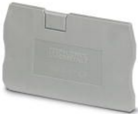
End cover, length: 48.6 mm, width: 2.2 mm, height: 29.1 mm, color: gray

Please be informed that the data shown in this PDF Document is generated from our Online Catalog. Please find the complete data in the user's documentation. Our General Terms of Use for Downloads are valid ( http://phoenixcontact.com/download )