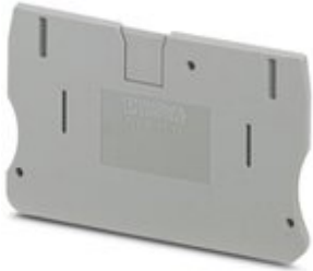
End cover, length: 67.7 mm, width: 2.2 mm, height: 42.6 mm, color: gray

Please be informed that the data shown in this PDF Document is generated from our Online Catalog. Please find the complete data in the user's documentation. Our General Terms of Use for Downloads are valid ( http://phoenixcontact.com/download )