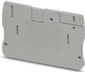
End cover, length: 57.7 mm, width: 2.2 mm, height: 36 mm, color: gray

Please be informed that the data shown in this PDF Document is generated from our Online Catalog. Please find the complete data in the user's documentation. Our General Terms of Use for Downloads are valid ( http://phoenixcontact.com/download )