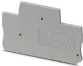
End cover, length: 68 mm, width: 2.2 mm, height: 39.6 mm, color: gray

Please be informed that the data shown in this PDF Document is generated from our Online Catalog. Please find the complete data in the user's documentation. Our General Terms of Use for Downloads are valid ( http://phoenixcontact.com/download )