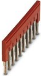
Plug-in bridge, pitch: 6.2 mm, color: red

Please be informed that the data shown in this PDF Document is generated from our Online Catalog. Please find the complete data in the user's documentation. Our General Terms of Use for Downloads are valid ( http://phoenixcontact.com/download )