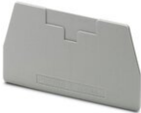
Cover, length: 72 mm, width: 2.2 mm, height: 41.5 mm, color: gray

Please be informed that the data shown in this PDF Document is generated from our Online Catalog. Please find the complete data in the user's documentation. Our General Terms of Use for Downloads are valid ( http://phoenixcontact.com/download )