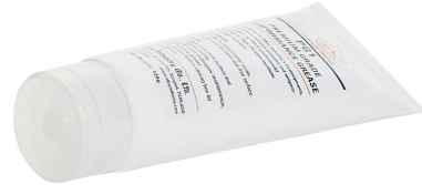
Net weight: 120g