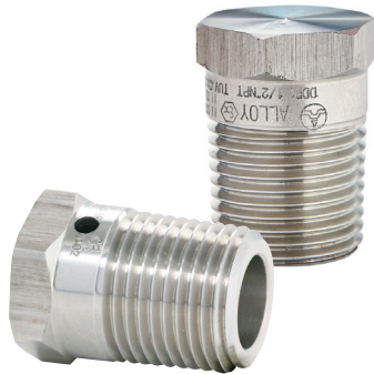
Approx. Weight ; 0.080 kgs.