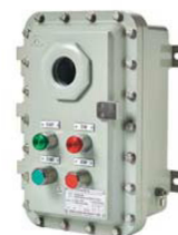
Explosionproof or Flameproof Control Box

In process areas or workplaces where the release of explosive substances cannot be eliminated, only the explosion protected equipment with at least one type of protection may be used in the hazardous classified areas. The types of protection for electrical equipment which are designed and manufactured according to NEC and IEC/ EN standards for any hazardous classified areas are listed below: