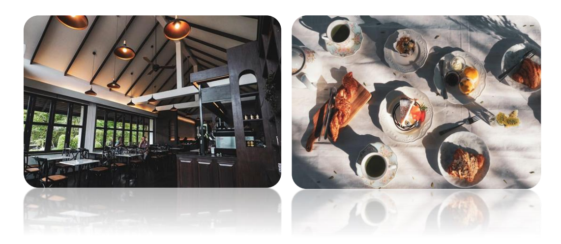
Noon Lunch at the restaurant

10.30 Along the way, stop for a snack at a coffee shop and take some nice photos at Sweet Cottage Bakery & Tea Room, a shady shop with an English-style garden. You can taste the bakery and quality beverages created by chefs from Le Cordon Bleu and CIA New York. And there are seats in the garden zone outside for you to choose to sit at many tables in many corners. Among the shady trees in a beautifully decorated English-style garden Anyone who wants to try the deliciousness of the bakery and premium drinks from the shop, come and taste it. Come check in.