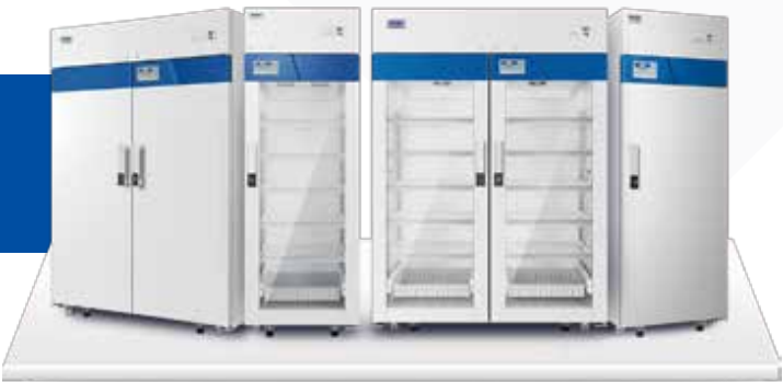
HYC-1099F HYC-509 HYC-1099 HYC-509F