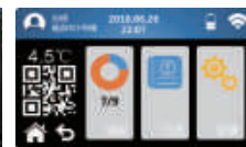
Operation system home page