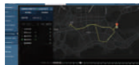
Real time tracking for blood bag location