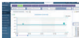
Precise temperature control, whole-process cold chain monitoring