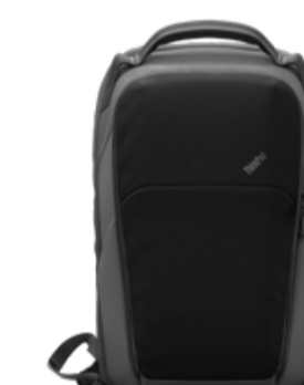
ThinkPad 16" Click-Go Backpack (Aura Edition) 4X41V20931