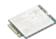
ThinkPad Rolling Wireless RW101R-GL SDX12 4G USB M.2 3042 module for CS2627 4XC1V64418