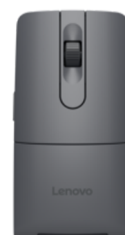
ThinkPad Bluetooth Presenter Mouse (Aura Edition) 4Y51T62792