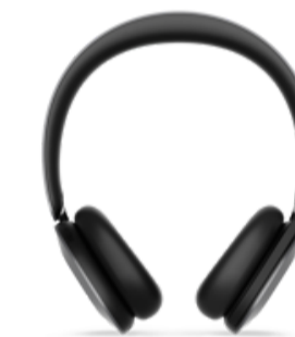
ThinkPad Dual-Mode Wireless ANC Foldable Headset 8550 (Aura Edition) - USB-A,... 4XD1V23301