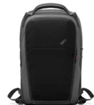
ThinkPad 16" Click-Go Backpack (Aura Edition) 4X41V20931