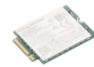
ThinkPad Rolling Wireless RW101R-GL SDX12 4G USB M.2 3042 module for CS2627 4XC1V64418