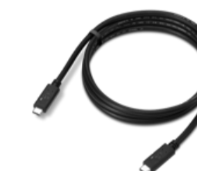
Lenovo USB 20Gbps USB-C to USB-C Cable 1.5m 4X91U92143