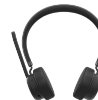
Lenovo Wireless VoIP Headset (Teams) 4XD1M80020